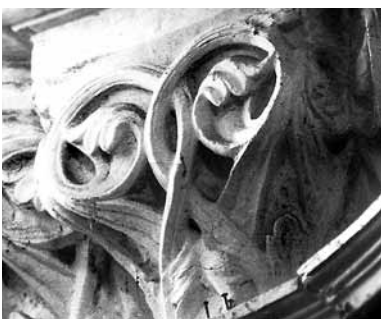
Chamery ES2(a) 1169

In an arbitrary way I have dated all the work between Senlis and Marigny at fairly regular intervals with an adjustment to suit the more solidly established construction schedule for the Laon triforium. v.6:ch 13.