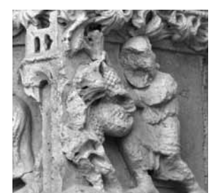
Senlis cathedral portal socle R4(d)