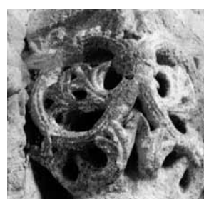
May-en-Multien III, S5ne 1153