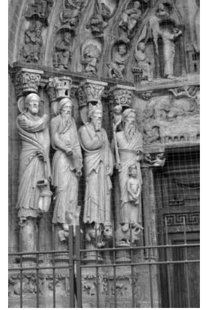
Senlis W.cL embrasure

There is nothing in the tympanum like this, nor in the lintel. However,