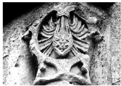
Laon, Saint-Martin W-nR(a+)

With little corroborative evidence I would hazard that the window over the north door at Saint-Martin in Laon with its pendulous berry and lower support for the tendrils was among the earliest in this group [r1], possibly followed by another minute campaign in Bazoches and then three campaigns in May-en-Multien. The dating is still very approximate