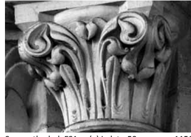
Sens cathedral ES1nw(a) in late-50s manner 1156