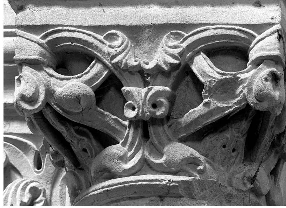
Senlis cathedral S9e(a)