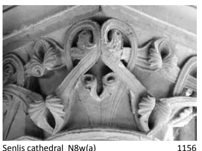
Senlis cathedral N8w(a)

The arrangements in some of these have become incredibly complex. Tips are furled, twisted and hung in ways that add to the excitement of the design. They double back to keep the eye within the block of the capital. There is great creativity shown in the arrangements, from the more complex