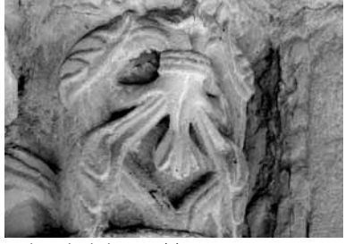
Senlis cathedral EN2nw(g)