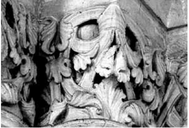
Senlis cathedral S11e(a)