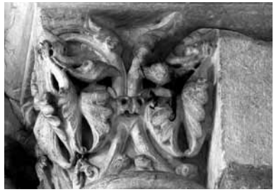
Sens cathedral As1ne(a)by Jérôme