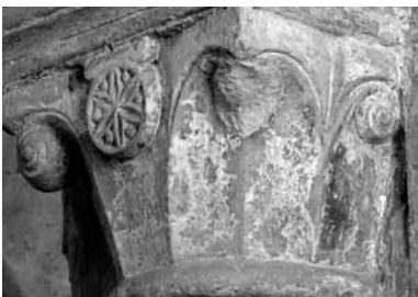
Louvres, Saint-Rieul Xse(a)