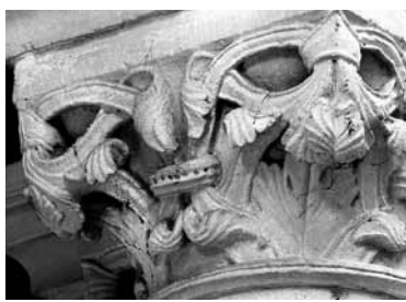
Senlis cathedral S10s(a)