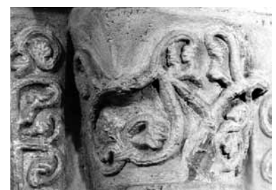
Bury north aisle 1108