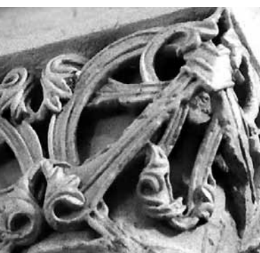
Veuilly-la-Poterie ES2e right corner