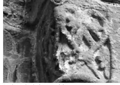
Senlis cathedral AN1sw(g)