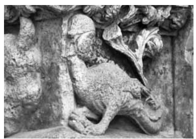
Senlis cathedral portal socle R4(d)

The animal with a flowering tail is similar to one of the capitals in the