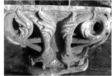
Creil unlocatable capital by Gripple père

continued to use his father's bulging corners, his collars and turned-over tips, though he eliminated the central frond in the bouquet. The vine has become a strap, fronds are turned down rather than up, the collar tightly holds the forms from expanding and in all things there is a greater rigidity.