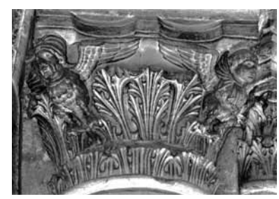
Paris, Notre-Dame As1(a) in 40s manner

The designs for pre-Crusade archivolts are assembled from separate units. Whether the individual voussoirs are adoring angels and Elders as