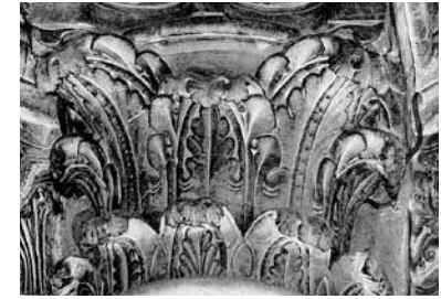
Paris, Notre-Dame En6(a) in 60s manner