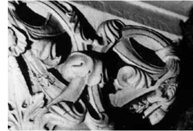
Senlis cathedral $10w(a)