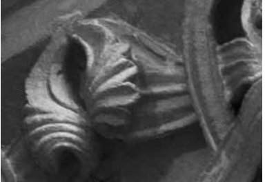
Senlis cathedral pier N8w(a)

In a second type of leaf he added a little rounded curl to the tip so that when the fronds turn upwards to meet their partners they display a sensitivity in the touching, almost a shyness in the meeting [b1]. This design is also found in the piers [b2,3].