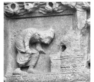
Senlis cathedral portal socie R4(d)