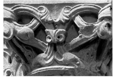
Senlis cathedral S9e(a)