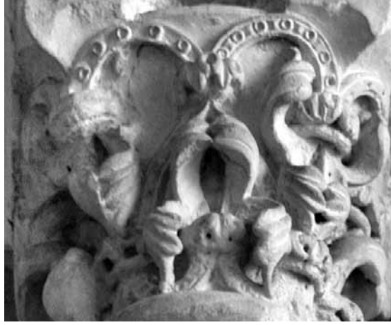
Laon cathedral north triforium SE2c(t)