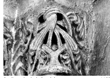
Senlis cathedral s5nw(a)