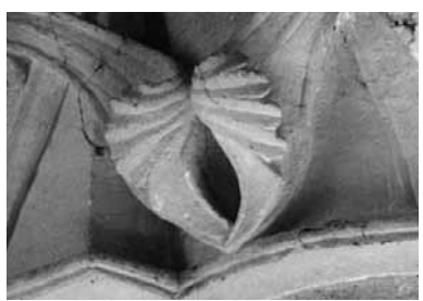
Senlis cathedral pier N8w(a)