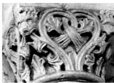
May-en-Multien apse I, S2n