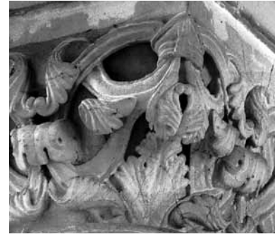
Grippleson: Senlis cathedral S11w(a)