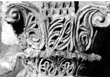
Crépy-en-Valois, Saint-Arnoul crypt