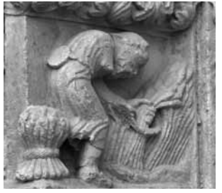
Senlis cathedral portal socle R4(d)

there is a possible connection with two archivolts that have some of the qualities of the socles, especially in the thick-edged clothing that falls as if bathed in mud and the agile humour in the posture [b1,2]. The fronds in the Jesse tree that surrounds these figures have pointed tips that curl back [b3]. In both archivolt and socle the figures are solid, almost dense, though in other respects the details in the socles are too damaged to hint at more than this.