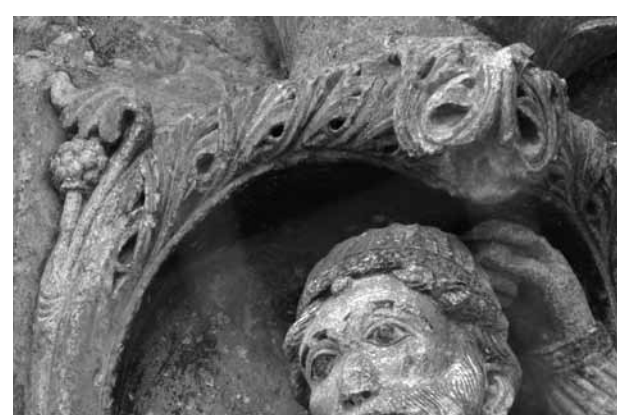
Senlis cathedral west portal bottom row of archivolt figures, first on the left and second on the right 1158