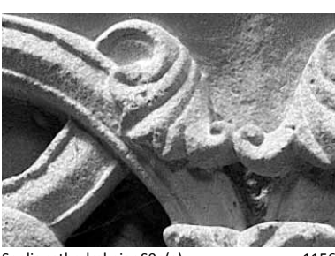
Senlis cathedral pier S9e(a)

After working on the aisle capitals he stayed on to carve some of the capitals over the statue-columns [b]. The originals are in the local museum and the pointed fronds strongly suggest the work of GrippleSon. The long