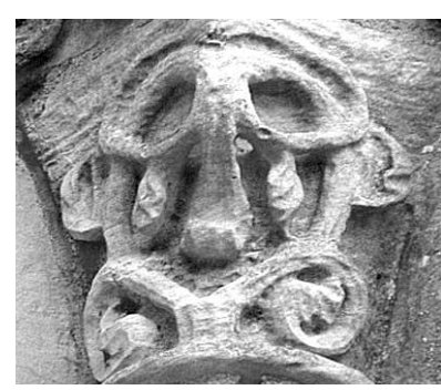
Gripple: Bruyères-sur-Oise tower stage 2

GrippleSon was more creative than the father, never resting in the arms of a single arrangement of fronds or leaves. In this, as in the template, he was like his master. The tendrils form a loop placed on the corner of the