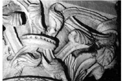
Senlis cathedral S11s(a)

to a simpler exploded arrangement in which the fronds are made to appear longer and more expressive.