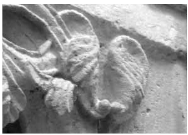
Senlis cathedral pier $11s(a)