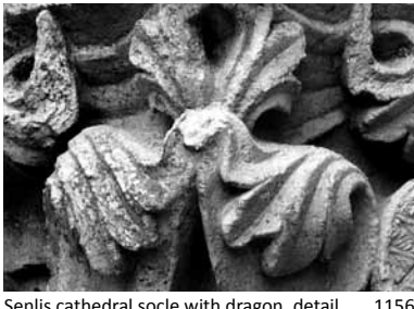
Senlis cathedral socle with dragon, detail

Together with the curves of the long trunk to the frond, its doublecurvature and the sinuous way it entangles itself around the bodies of the dragons, it is hard not to see the presence of the same hand in all.