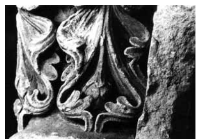
Senlis Museum, the remains of three capital from portal. The left still has traces of one of the baldachins